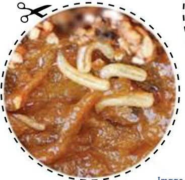
Image by: Applied Horticultural Research and Horticultur Innovation Australia